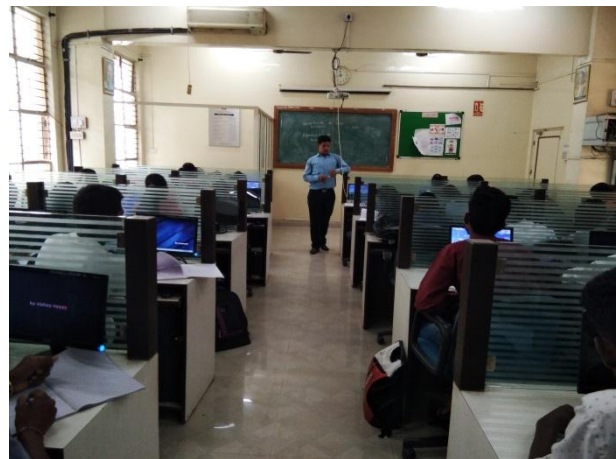
Tally ERP 9 Course