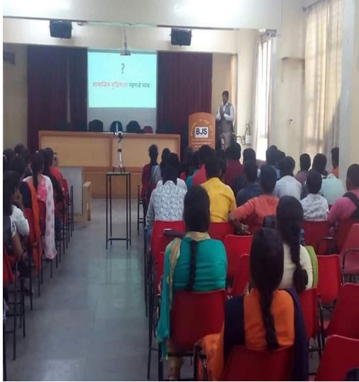
‘Social Intelligence Workshop’