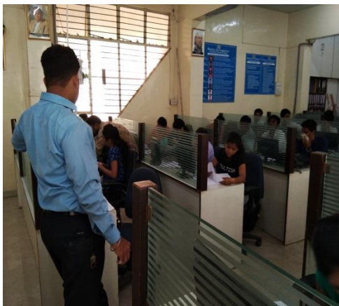
Tally ERP 9 Course