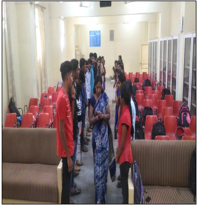
Activity ‘Competitive Exam Workshop’