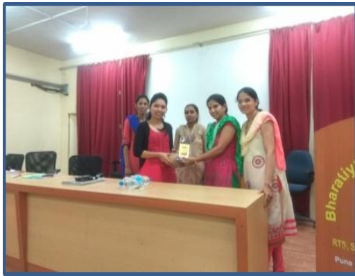
Commerce staff with guest.