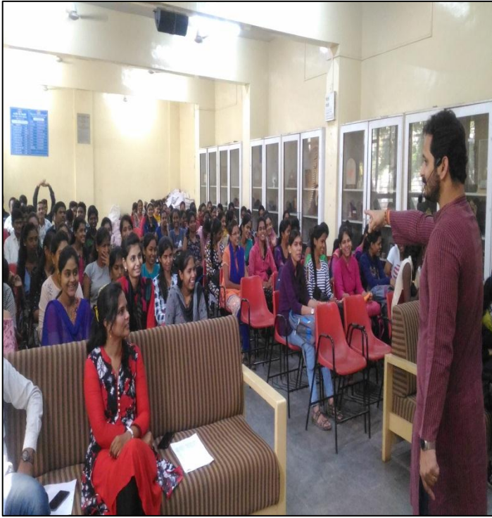
‘Corporate Kirtan Seminar’